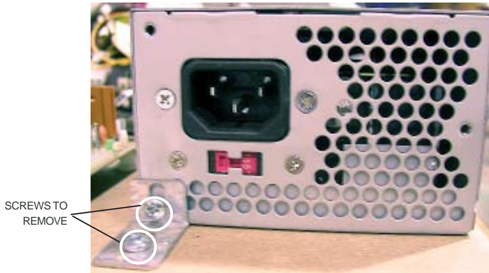
FIGURE 3 - CLOSEUP OF LEFT REAR BRACKET AND SCREWS RIGHT FRONT SCREWS ARE LOCATED DIAGONALLY (SEE FIGURE 2)