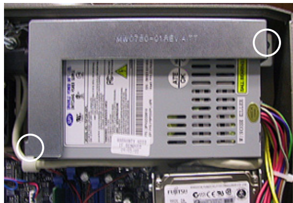
FIGURE 2 - POWER SUPPLY MOUNTING SCREWS (2 PLACES)