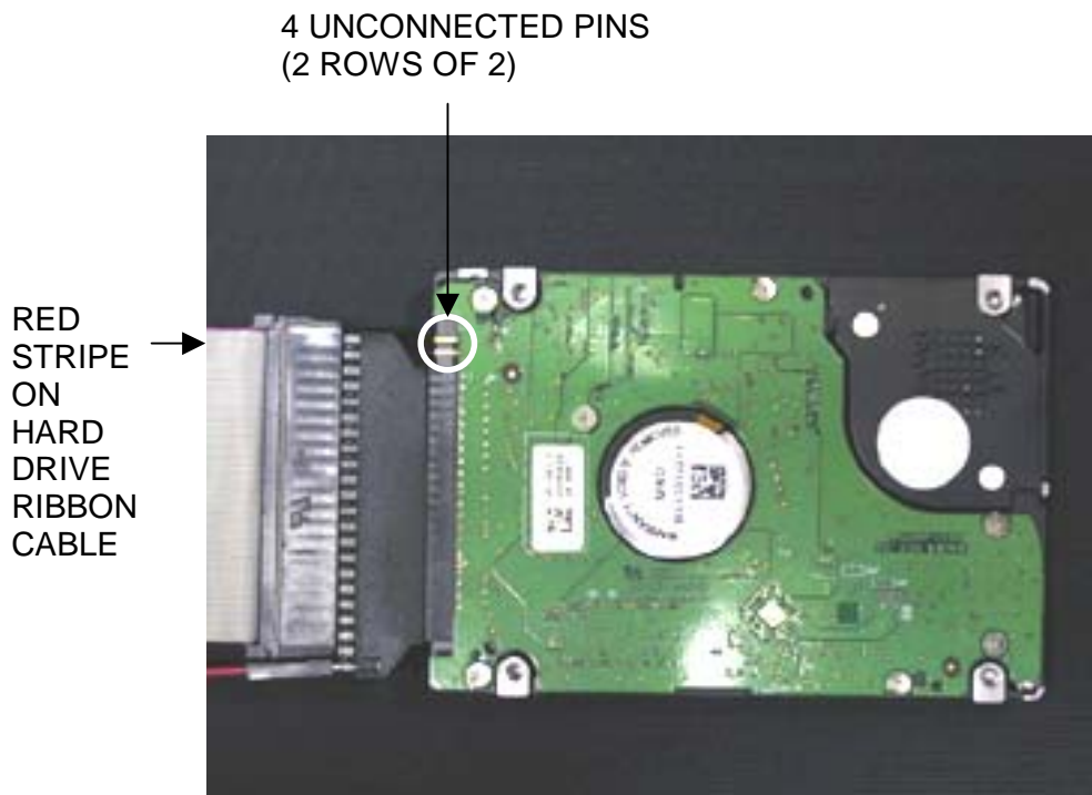
FIGURE 2 - CIRCUIT-BOARD SIDE OF HARD DRIVE