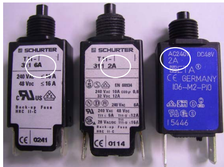
6A WHITE LABEL 2A WHITE LABEL 2A BLUE LABEL